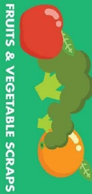
FRUITS & VEGETABLE SCRAPS