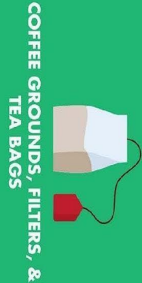
COFFEE GROUND, FILTERS, & TEA BAGS