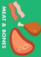
MEAT & BONES